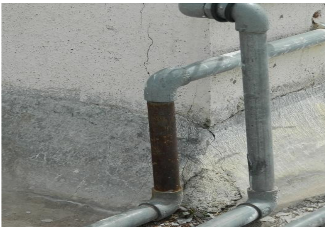
Fig 1. corrosion in pipes

B. Corrosion of Pipes Due To Hard Water: Corrosion in pipes occurs due to hard water, the amount of minerals content in water or due to external climatic condition. It may not occur at initial stage but problems may arise at a later stage with the increase in its use.