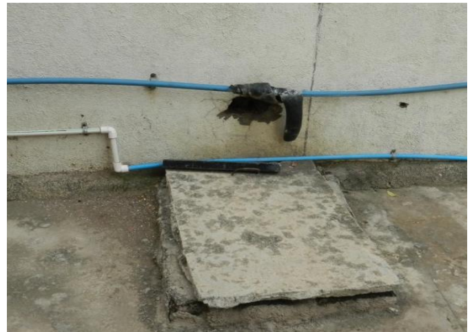
Fig 2. temporary repair in pipes

I. Fittings Used During Repairs And Replacement Of Pipes: After repairs, replaced fittings should be of appropriate size and material otherwise mismatch may cause leaks.