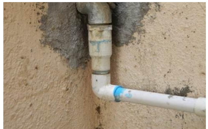
Fig 6. connection between two different materials