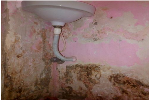
Fig 12. wash basin leakages seepage in the wall

B. Water Closet: Water closet used in residential building may be Indian, European or combination. But problems related to all types of W.C are flush do not operate, overflow of flushing cistern, foul smell, black flow and leakage. This is due to traps, connection with pipes and fittings. Sometimes these leakages cause seepage in a wall and damage the structural component.