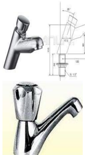
Fig 11. faucets where leakages arise