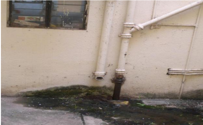
Fig 3. algae deposits around the pipe

trees. As the plant grows, its roots reach out farther to support its weight and in search of more nutrients and moisture from the pipe wall. This damages the pipes causing it to leak.