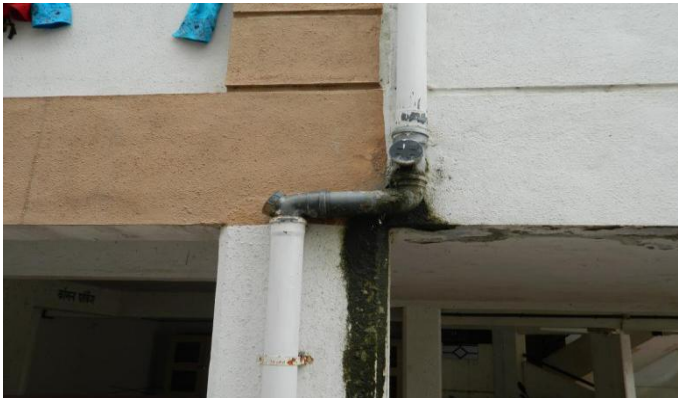
Fig 4. Fittings between pipes are at right angle