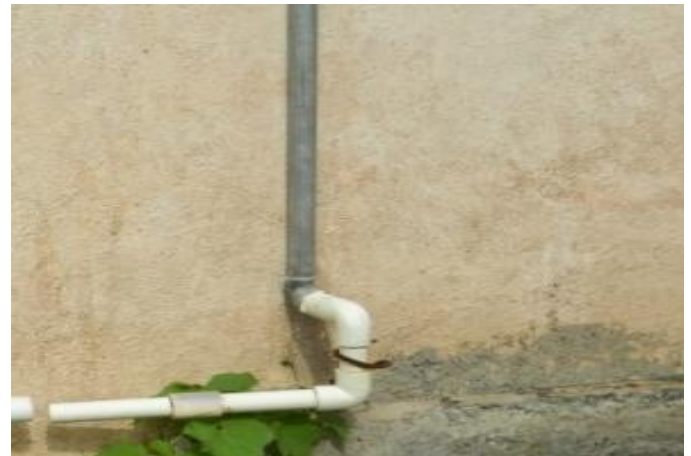
Fig 5. connection between two different materials.

F. Damage during Replacement: Minor repair and replacement jobs, if not properly executed, may cause leakage.