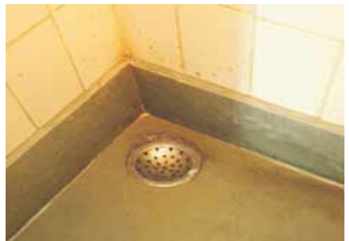
Fig 9. nahani traps