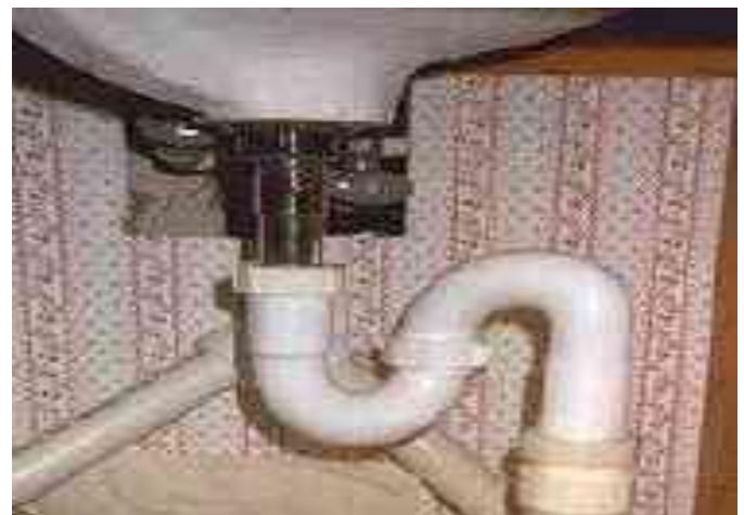
Fig 8. wash basin with 's. trap