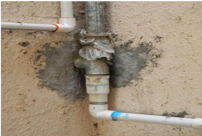
Fig 7. connection between different materials of pipes

F. Use of Dissimilar Material: When fittings of two different materials are used then fittings may not appropriate for both materials e.g. G.I. and PVC/ CPVC.